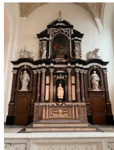
Figure 3. Michelangelo's Madonna and Child in the Church of Our Lady

Travel to additional collections within Flanders in present day Belgium also have aided in this interpretation and understanding of differences and similarities between Dutch and Flemish art. The collections I have been fortunate to visit include: Museum of Fine Arts Ghent, The Castle of the Counts, Ghent Belfry, the Design Museum, Broeningemuseum, Museum of The Church of Our Lady