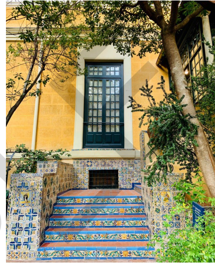
Figure 2. Inside Sorolla's garden, leading up to his house and current museum.

Other institutions I was fortunate to visit included: Museo Nacional Centro de Arte Reina Sofia, National Archaeological Museum, Sorolla Museum (Figure 2), Neptune Fountain, Palacio de Cristal, Estanque Grande del Retiro, Thyssen-Bornemisza Museum, Royal Palace of Madrid, Plaza Mayor, Temple of Debod, and the Catedral de Santa María la Real de la Almudena. Viewing Spanish art in particular allowed me to see the influence of Spanish art on Flemish art as the Spanish Crown ruled the Lowlands including Flanders from 1556 to 1714. This provided me with a better understanding of so many Dutch and Flemish collections that I am surrounded by everyday.