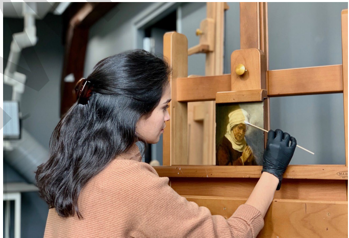
Figure 1. Reducing discolored varnish off of a painting previously attributed to Rembrandt, the painting is now considered to have been executed by someone within Rembrandt's circle.

Studying in The Netherlands has become an important goal for my academic work and research, and I have enjoyed embracing Dutch culture from a personal perspective and to learning the differences and similarities in European conservation practices as compared to the American conservation curriculum. Part of expanding my perspective on conservation approaches has been to visit nearby studios and training programs. This has included visiting the third-year paintings University of Amsterdam